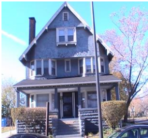
ORCA House Women's Residential Program